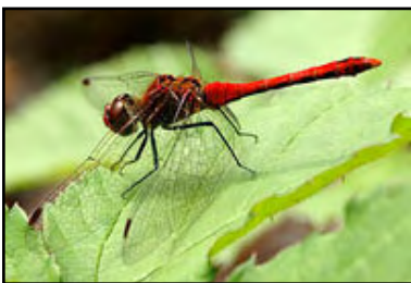
Ruddy Darter Dragonfly (bright red)

Is it a hawk or a darter dragonfly? Darters have shorter, fatter bodies and often perch on reeds waiting for prey. Hawkers are longer and thinner and fly around catching other insects.