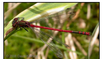
Large Red Damselfly (bright red)