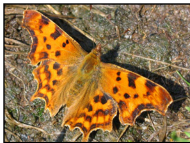
Comma (orange speckled with brown)