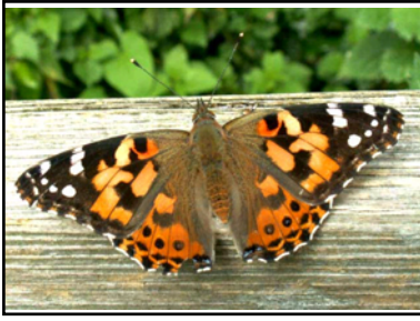
Painted Lady (white specks on wing, not bars)