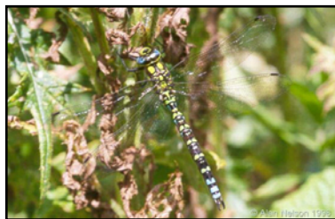
Southern hawkler Dragonfly (black with blue and yellow markings)