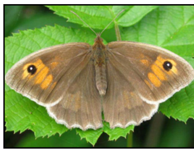
Meadow Brown (two small orange patches)