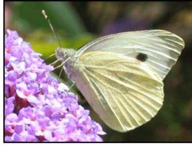
Large White (large and white!)