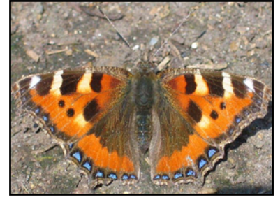
Tortoiseshell (black and white bars on top of orange wings)