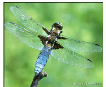
Broad-bodied Chaser Dragonfly (blue)