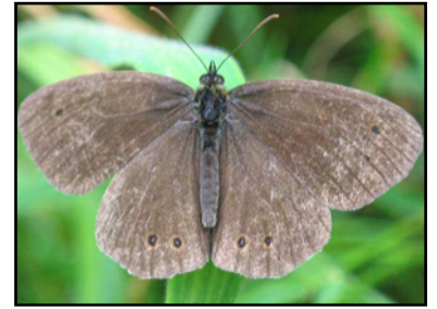
Ringlet (brown with small dark spots)