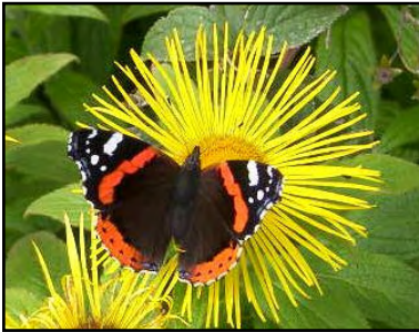
Red Admiral (black with red and white markings)