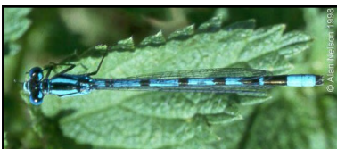
Common Blue Damselfly (blue and black striped)