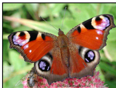
Peacock (red with colourful spots)