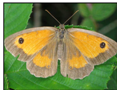
Gatekeeper (four large orange patches)