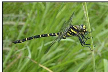
Golden-ringed Dragonfly (yellow and black striped)