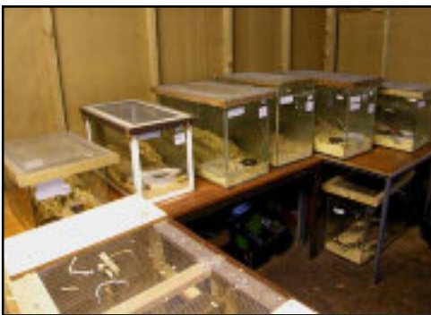
Water shrew tanks housed indoors

The bottom of the tank is lined with sawdust and soil for burrowing. Straw is provided for nest building. Small tubes are also provided to allow cover, as if the shrews were burrowing into a bankside habitat. A large bowl of water is provided at the front of the tank for swimming, with pebbles to enable the shrews to climb in and out.