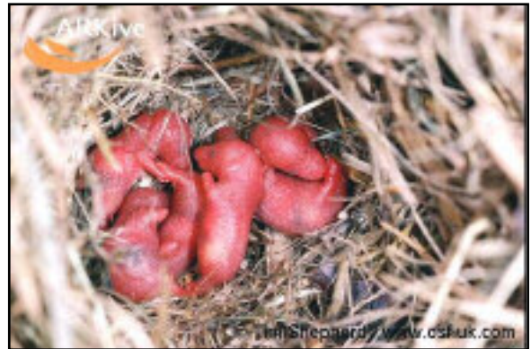
Young water shrews in the nest

Water shrews are solitary in the wild and due to their territorial behaviour are not kept together all year. They are paired up for breeding in the spring. A single pair comprising two different bloodlines is put together in a large breeding tank to maximise the bloodlines produced.