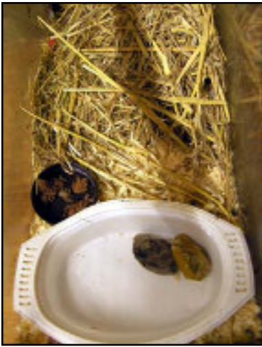
Internal design of a water shrew tank

Water shrews at Wildwood are housed in glass tanks which are 64 x 33 x 40cm in size. These tanks are covered by a lid with a 1.5cm 2 mesh size; this is a suitable size to prevent any young shrews from escaping.