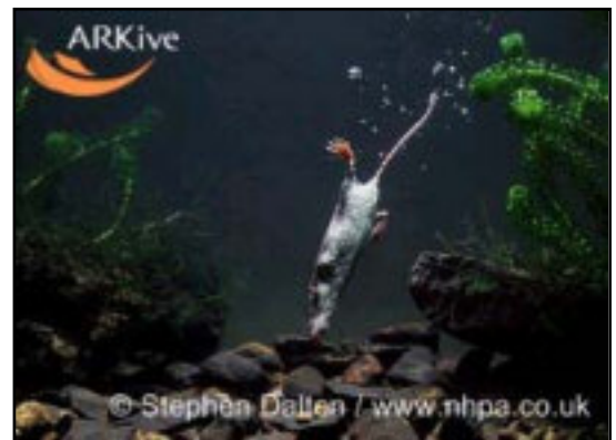
Water shrew diving

In favoured sites such as water-cress beds, a maximum density of 3-5 shrews per hectare have been recorded. This is a low population density compared to other small mammals such as common and pygmy shrews. Sites need to be at least one hectare in area; large enough to support a viable population in an optimal habitat. Suitable sites should be part of a more continuous habitat which provides a dispersal route for immigrants from nearby areas 1 .