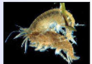
Water shrews feed on small freshwater crustaceans

In the wild, a large proportion of the water shrew's diet consists of insects; their teeth wear down quickly, despite the distinctive red tips on the teeth which are believed to provide thicker enamel. In captivity, as they are fed a lot of soft foods as well as insects, their teeth may not wear down as fast and this may increase their longevity.