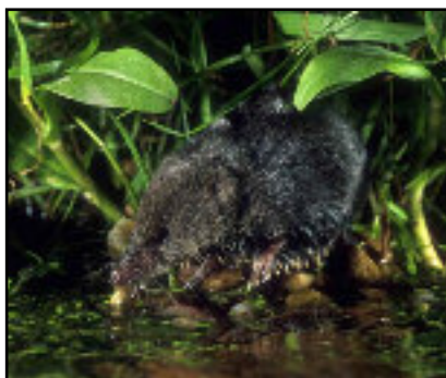
Water shrew by bankside vegetation

The population estimate for the UK is 1,900,000 individuals; 300,000 in Wales, 400,000 in Scotland and the remaining 1,200,000 in England. Populations are patchily distributed and often occur only for short periods of time. Water shrews are generally found along the banks of clear, fast-flowing freshwater rivers and streams and also ponds, reedbeds and fens. Habitat choice is probably influenced by water depth, velocity, suitable cover as well as