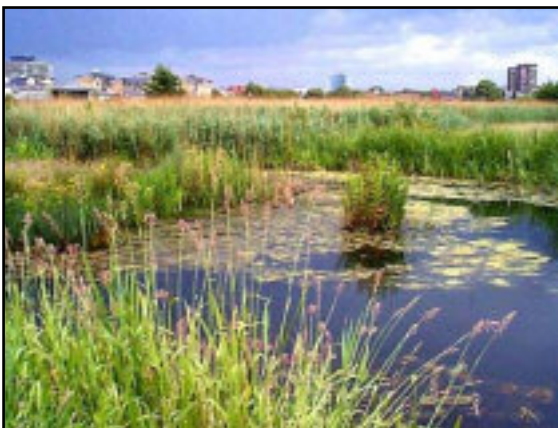
Good water vole habitat

Previous WildCRU (Wildlife Conservation Research Unit) research has shown that the density of water vole populations is extremely sensitive to the amount of vegetation present at a site, since vegetation provides both food and shelter.