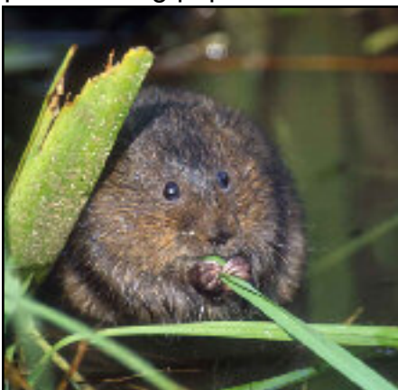
Water vole eating grass

A recent population estimate, published by the Mammal Society in 2004, suggested a total pre-breeding population in Britain of 875,000 individuals. The water vole, once common and widespread in lowland Britain, has suffered a significant decline in numbers and distribution in recent years.