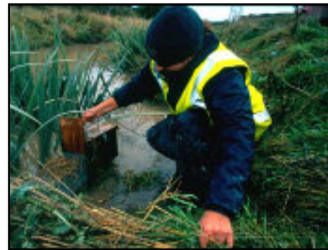
Water vole trapping

Water vole sites are monitored to follow the stability of the population. Monitoring can be done through direct trapping or through observing field signs, including latrines, feeding stations, burrows and footprints.