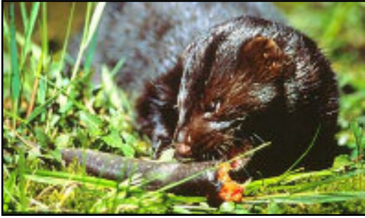
Introduced American Mink

Although the water vole may still remain locally common, the overall trend for the species is one of decline.