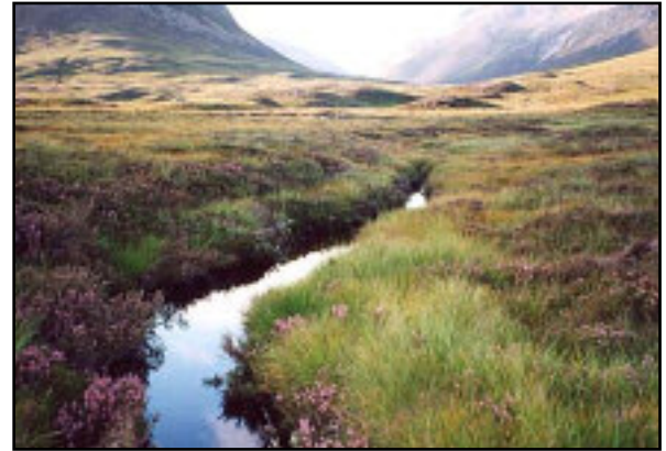
Suitable upland vole habitat

table 3 . Sites excessively shaded by shrubs or trees are less favoured.