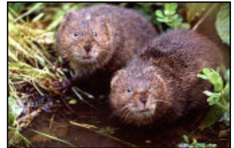
Water vole pair

The water vole did not gain legal protection until 1998, under Schedule 5 of the Wildlife and Countryside Act 1981. It is covered in Section 9, which only protects its place of shelter and not the water vole itself. Statutory Nature Conservation Organisations (Natural England, Scottish Natural Heritage and Countryside Council for Wales) can issue licences for reasons of conservation, education and scientific research, to allow otherwise prohibited actions.